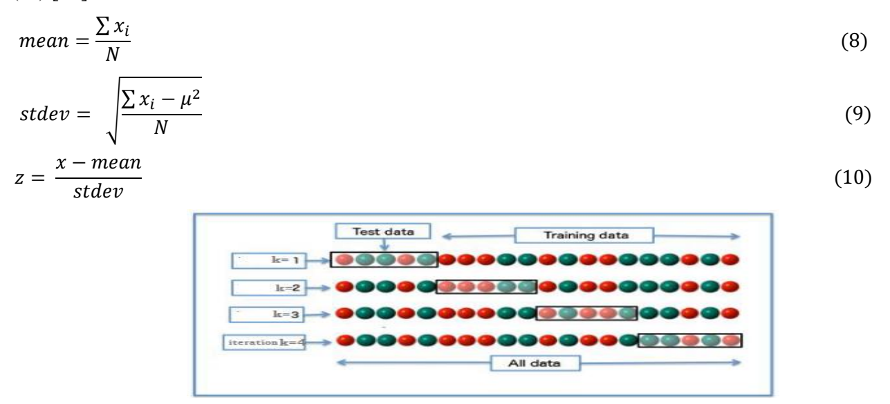
Figure 2. Ilustrasi 4 Fold Cross Validation

The data training process using the NB and PROMETHEE methods goes through a k-fold process as a form of evaluating the training results, then calculated using the k -fold cross validation method. In this method, the training data was evaluated by a number of k -subsets formed. The way the k -fold method works is by dividing the data a number of k , then iterating the test data on the training data as much as k subsets as well. The use of k -fold crossed validation to eliminate bias in the data. The preprocessed data were carried out by cross validation by dividing the data into training data and test data for the classification process. The test model was carried out 3 times and each data subset will have the opportunity as testing data or training data, as shown in Figure 2. The next method used is z-score normalization. Z-score normalization is a normalization method based on the mean (average value) and standard deviation (standard deviation) of the data. This method is very useful if the minimum and maximum actual values of the data are not known, it can be seen in equation (10) [31].